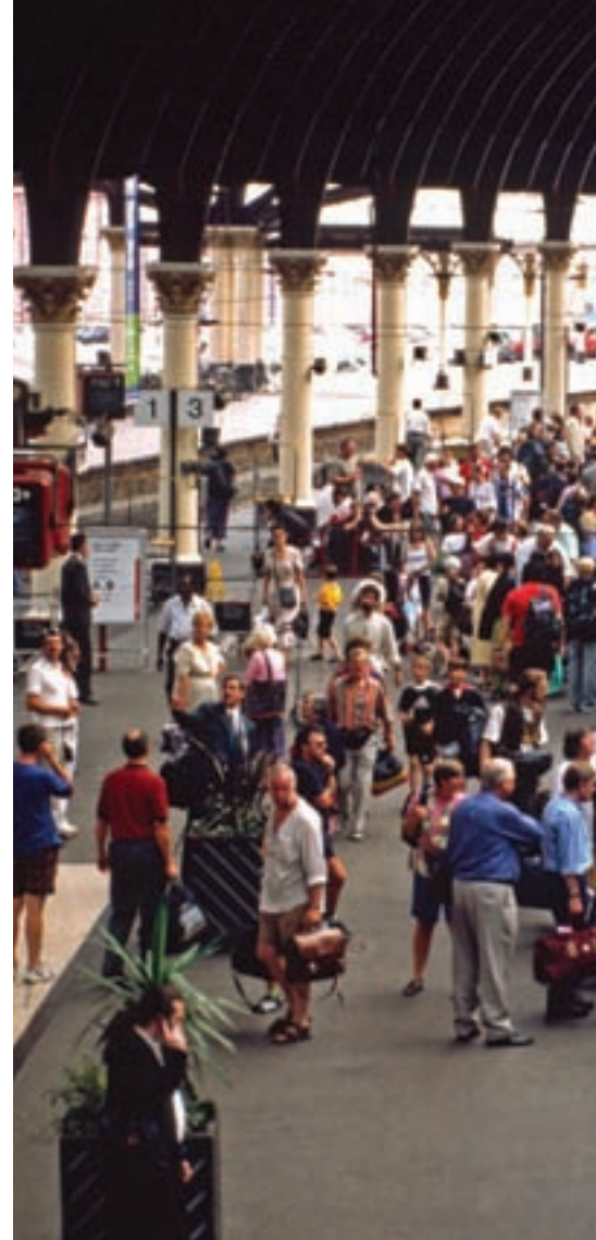
York station: Connection times would be much improved if Swiss ideas were implemented on the ECML.

principles and methodology could shape a timetable for the ECML that is superior – in terms of connectivity, deployment of capacity, net benefits and the public interest – to any that might emerge from an edifice of dispersed responsibilities? And if so, is there a way in which open access could be incorporated? In 2006 Atoc commissioned Passenger Transport Networks (PTN) to research these questions, using the Swiss Viriato software.